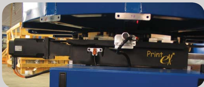
Ultra-Smooth™ Servo Indexer

European Technology • Quality Service • Affordable Price