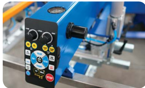
Full Function Printheads

European Technology • Quality Service • Affordable Price