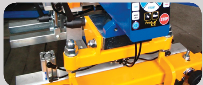
Front Screen Air Clamps